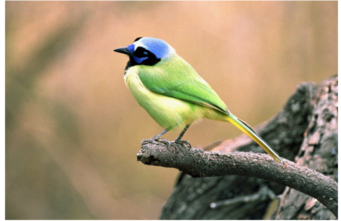
House of Birds – 5 acres