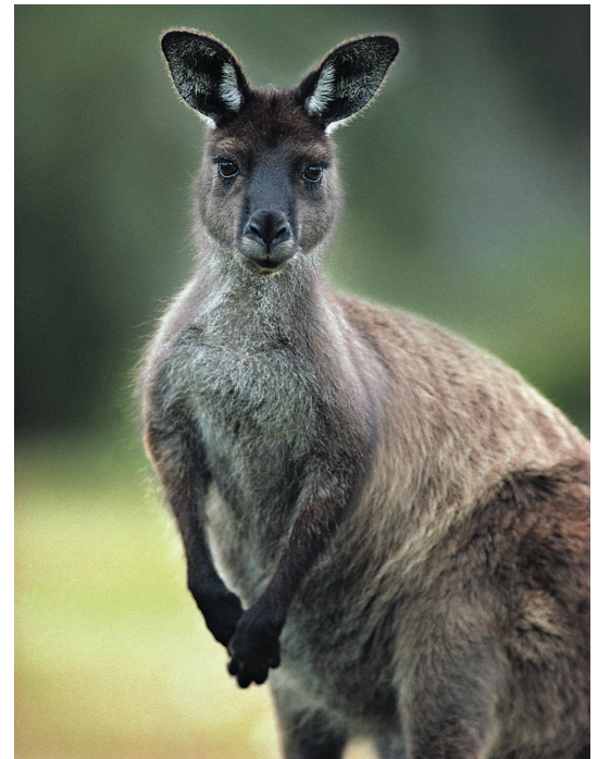
Kangaroo – 1/2 acre