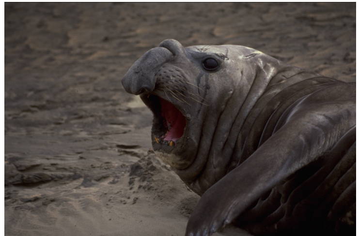
Seal – 1/2 acre