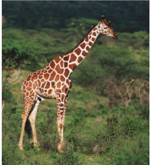
Giraffe – 1 acre