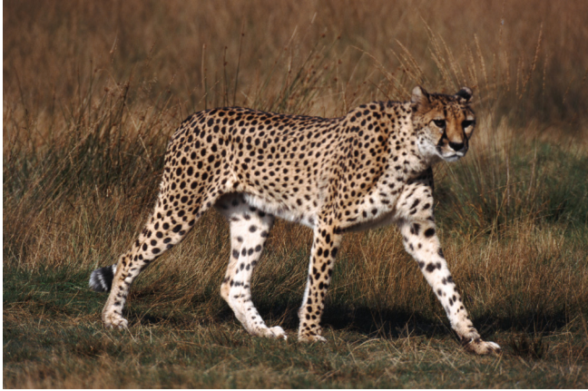
Cheetah – 1 acres