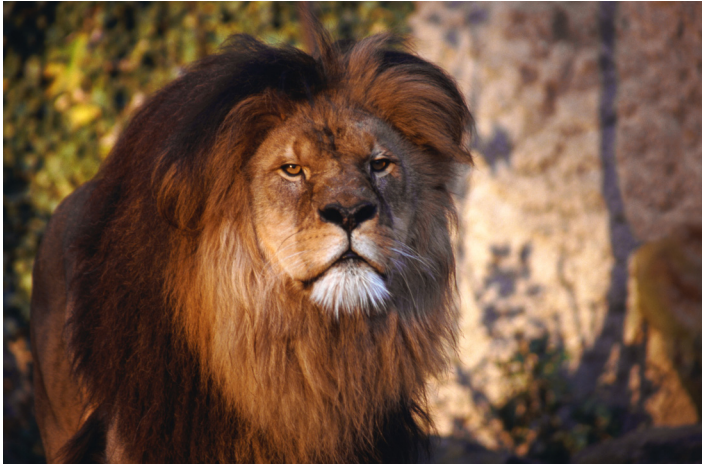
Lion – 2 acres