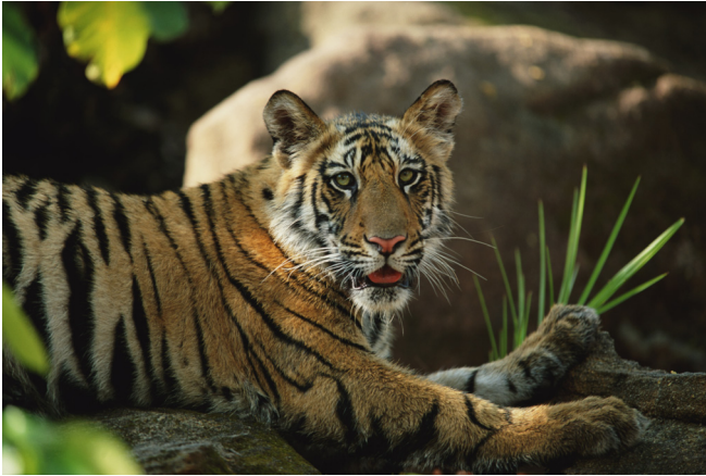
Tiger – 1 acre