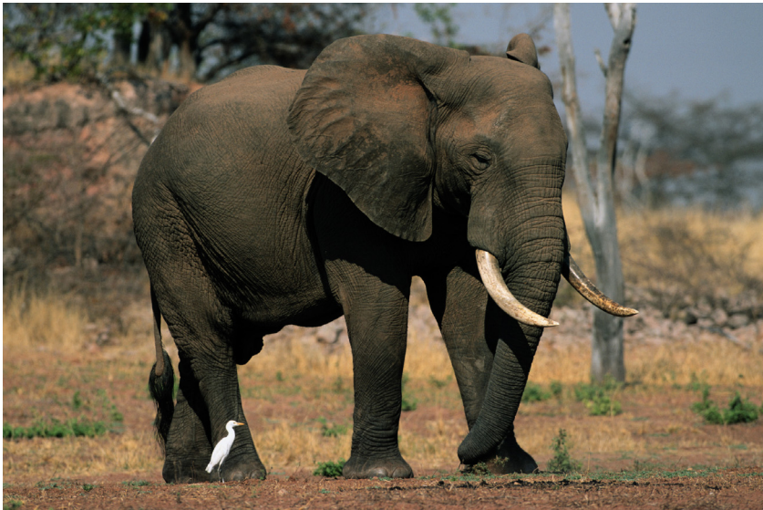
African Elephant – 3 acres