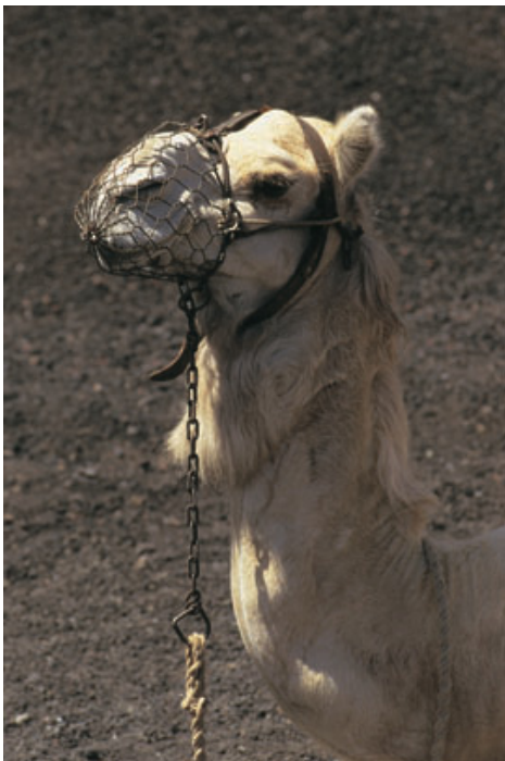
Camel – 1/2 acre