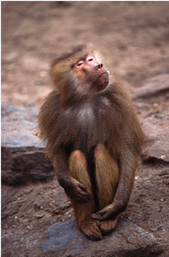
Monkey – 1/2 acre