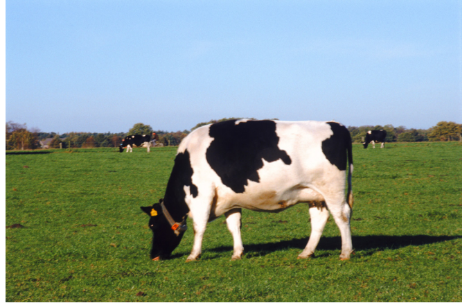
Cow – 1/3 acre