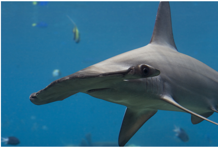
Hammerhead Shark – 1/2 acre