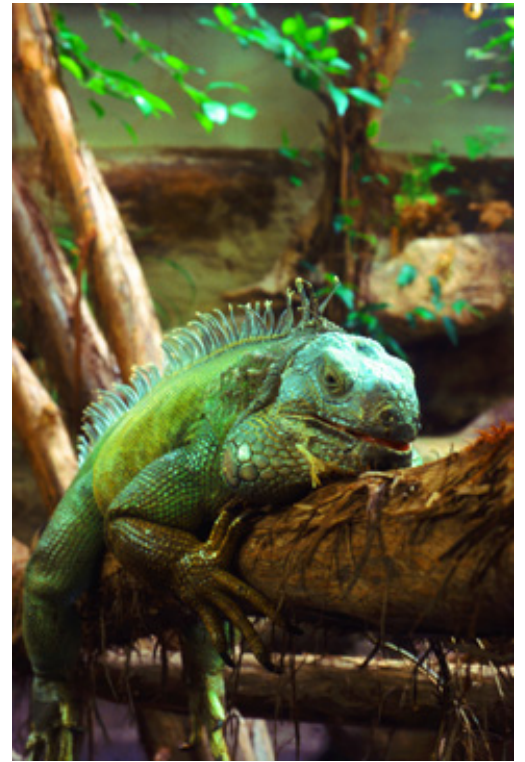
Reptile House – 5 acres